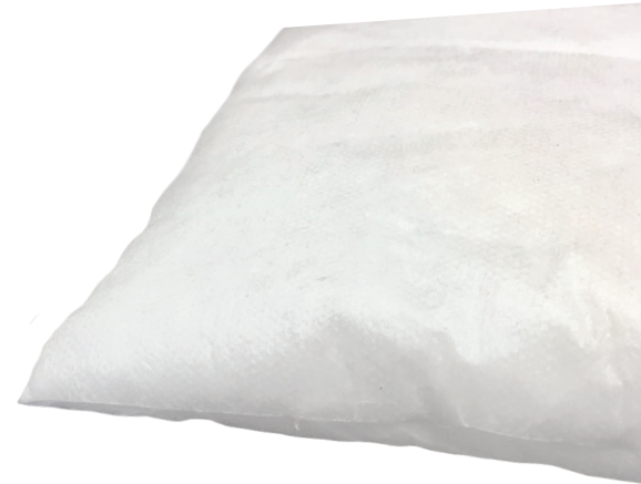
Normal Incidence Sound Absorption

Note: Data in the table above is based on roll goods.